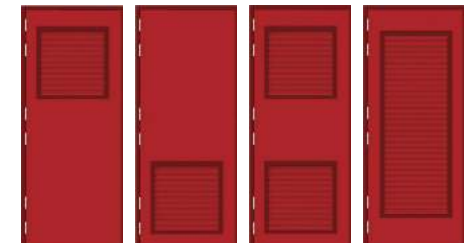
Insert louvre top Insert louvre bottom Insert louvre top & bottom Insert louvre large single