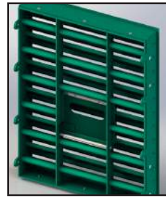
External and internal view of a louvered panel

Louvered panels are LPCB certified to LPS 1175 SR3. An optional cable port can be integrated, as shown above.