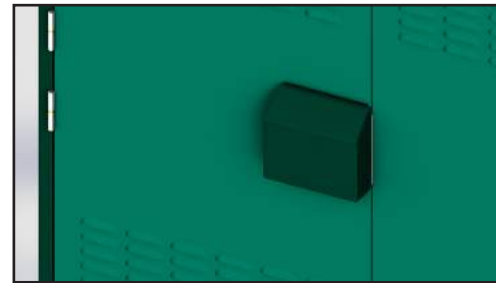
Padlockable lock cover

Louvered panels are LPCB certified to LPS 1175 SR3. An optional cable port can be integrated, as shown above.