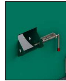
External and internal view of a cable port

Cable ports can be integrated into M2M +SUB doors to allow the passing of cables through the doorset.